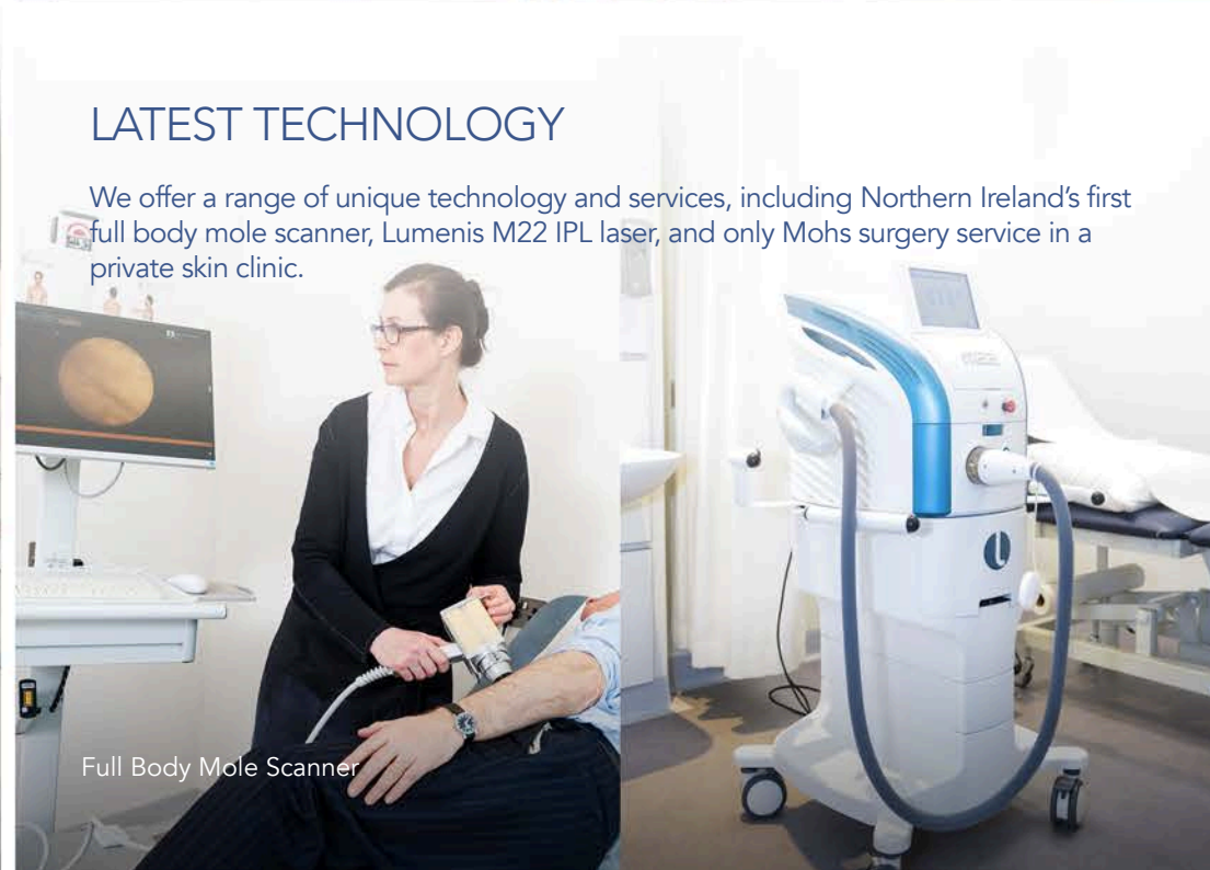
Full Body Mole Scanner

We offer a range of unique technology and services, including Northern Ireland's first full body mole scanner, Lumenis M22 IPL laser, and only Mohs surgery service in a private skin clinic.